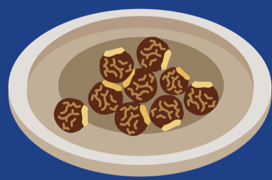
lerak Sapindus rarak