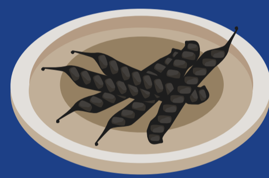
bồ kết Gleditsia australis